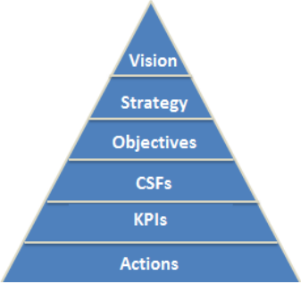
Fig. 1 Hierarchy of Strategic Management Development: Mind tools [12]

developed by Glisby and Holden [11], who state that knowledge possessed by people within an organisation, or “tacit” knowledge, represents a genuine source of competitive advantage, however it is critical to translate the “tacit” to “explicit” knowledge, thus allowing it to be measured, and aligned to the overall strategic vision of the company. The process of developing a clear linkage between the activities (actions) of managers within their daily roles and the overall strategy and vision of the organisation is depicted in Figure 1. The hierarchy indicates an upward chain of interactions starting with the daily “actions” of individual managers, which are primarily assessed by individual KPIs. The individual managers KPIs are subsequently aligned with the CSFs (Critical Success Factors) of the organisation to ensure actions are linked with overall company success. Finally the CSFs are aligned with the organisational objectives, strategy and vision.