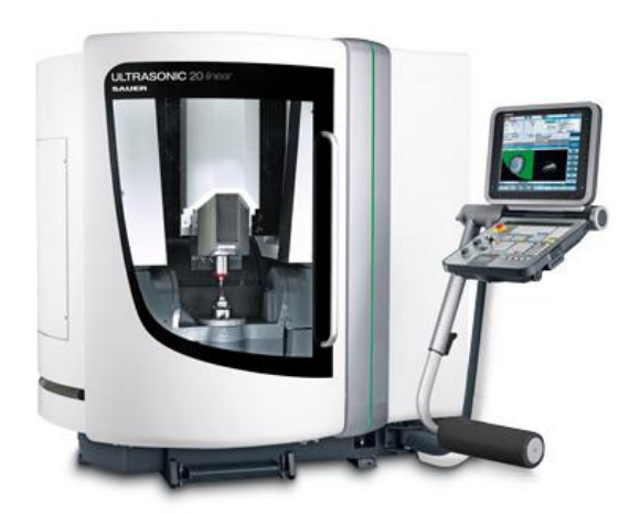
Fig. 1 ULTRASONIC 20 linear <sup>6</sup>

Rotary ultrasonic machining (RUM) is applied in experiments. RUM utilize rotary tool, which oscillate by ultrasonic frequency (above 20 kHz). Interaction of rotating motion and vibration cause microcracks on surface, which are broken and lead away as microchips. This effect is also enhanced by cavitation effect of coolant. Coolant is feed on tool-workpiece interface and therefore proper properties of coolant are necessary. Due to this principle, very hard and brittle materials can be machined. Advantages of this process include decreasing of cutting force, reduction of generation of heat, increasing of tool life, improving of machined surface (roughness, accuracy), etc. In this experiment, rotary ultrasonic milling machine ULTRASONIC 20 linear (see Fig. 1), made by DMG Mori Seiki has been used. It can work continuously in five axis (6,7,8,9).