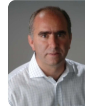
Pedro F. Cuhna Polytechnic Institute of Setúbal Lisbon, Portugal