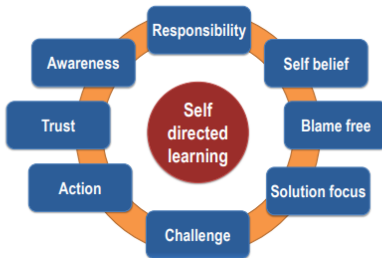
Fig. 1 : 8 Key Principles of Coaching