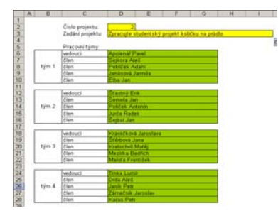
obr. 1 – zápis týmů

In determining the appropriate project task is the integration of individual subjects in solving the problem presented, identify educational objectives and their fulfillment konkrétneho. The project presents the students one or more concrete and real tasks. Their aim may be to create a reasonably complex and exit either in the form of the product, finding the most appropriate option or formulating their own opinion. In the course of their project management tasks, at the beginning of the semester