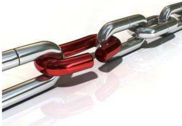
Fig. 1. Weakest link in the chain

A system is generally defined as a collection of interrelated, independent processes that work together to turn inputs into outputs in the pursuit of some goal. As pictured above, the chain has one “weakest link.” If force is applied to the chain at an increasing rate, it would eventually break at this point. Therefore, the weakest link is the constraint that prevents the chain (system) from doing any better at achieving its goal (transmitting force).